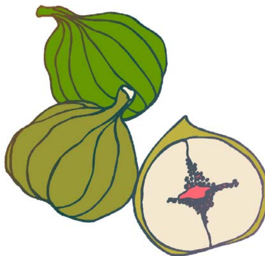
Fig preserves are also readily available. But make sure to choose varieties containing 100 percent fruit with no added refined sugar.

The best way to “chop” dried figs is to cut them with kitchen-only scissors. When the scissors start to become sticky, simply run them under warm water.